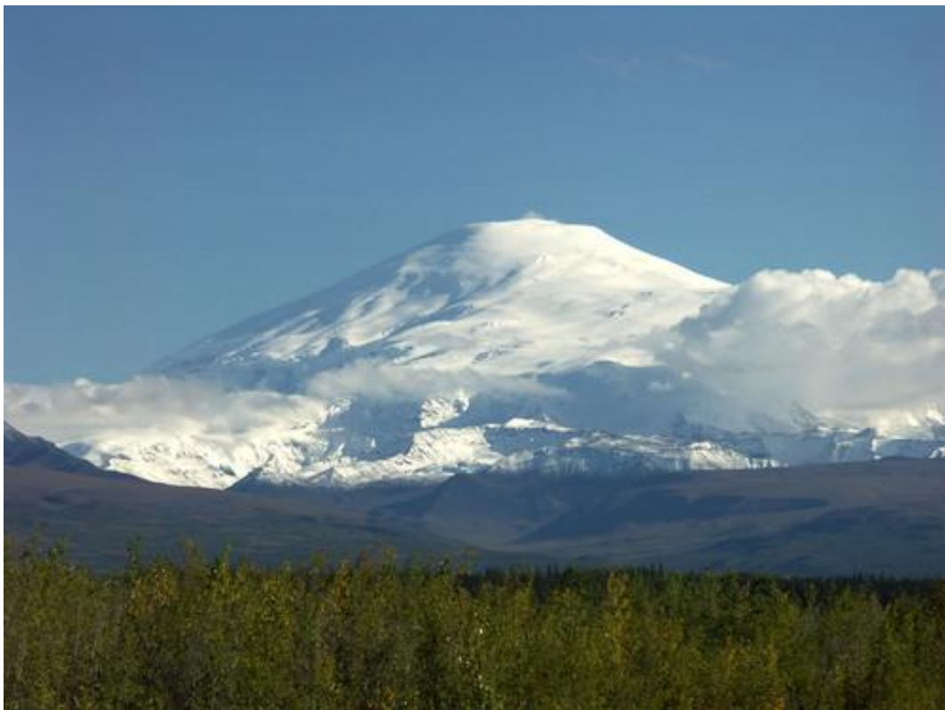
Mt. Wrangell (14, 163 ft.)