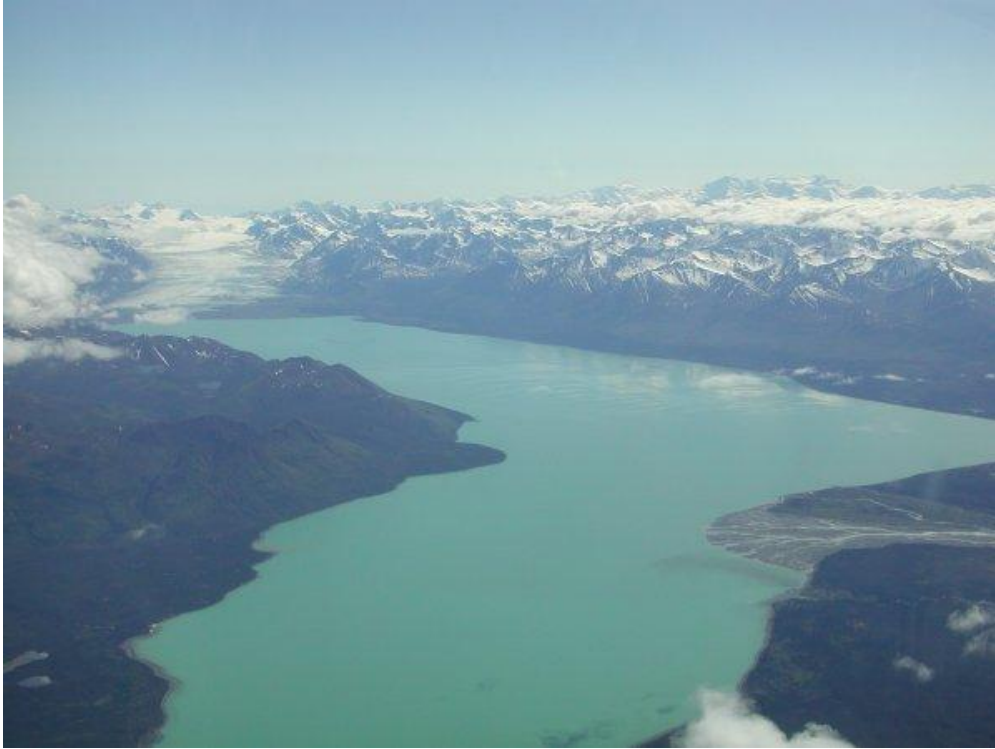
Tazlina Lake and Tazlina Glacier in distance. The long-abandoned Tazlina Lake Village was near this outlet.