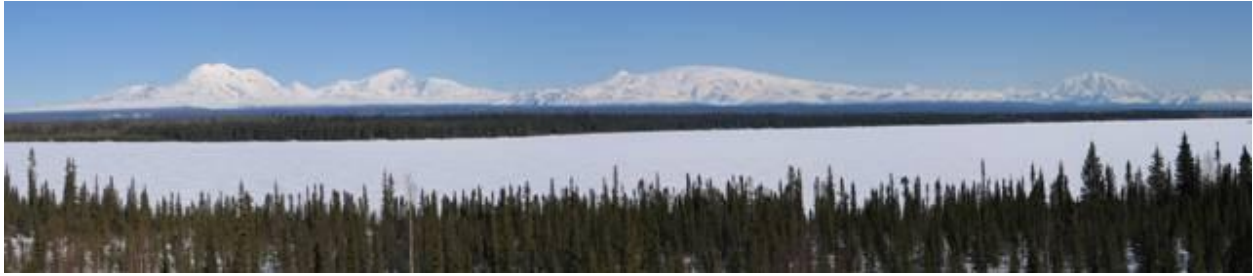
Mountain view from Willow Lake on Richardson Highway