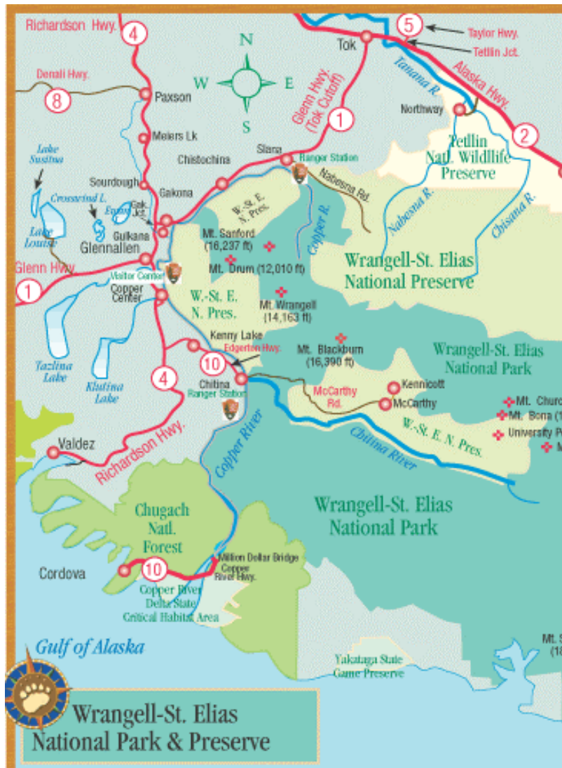
Map of region