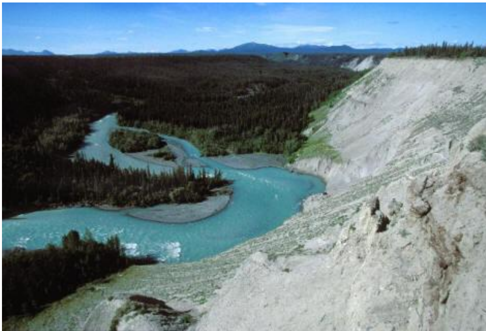
Klutina River from Craig-Brenwick Rd. Klutina Lake is in the valley about 20 miles away in the distance.