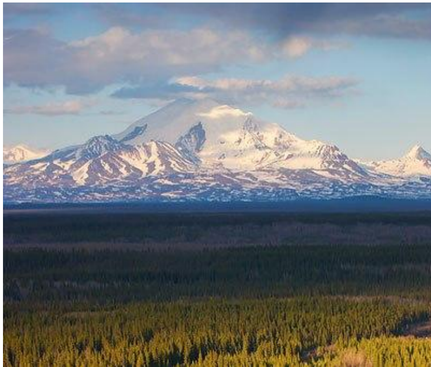
Mt. Drum from the author's cabin in Tazlina (c. 1995)