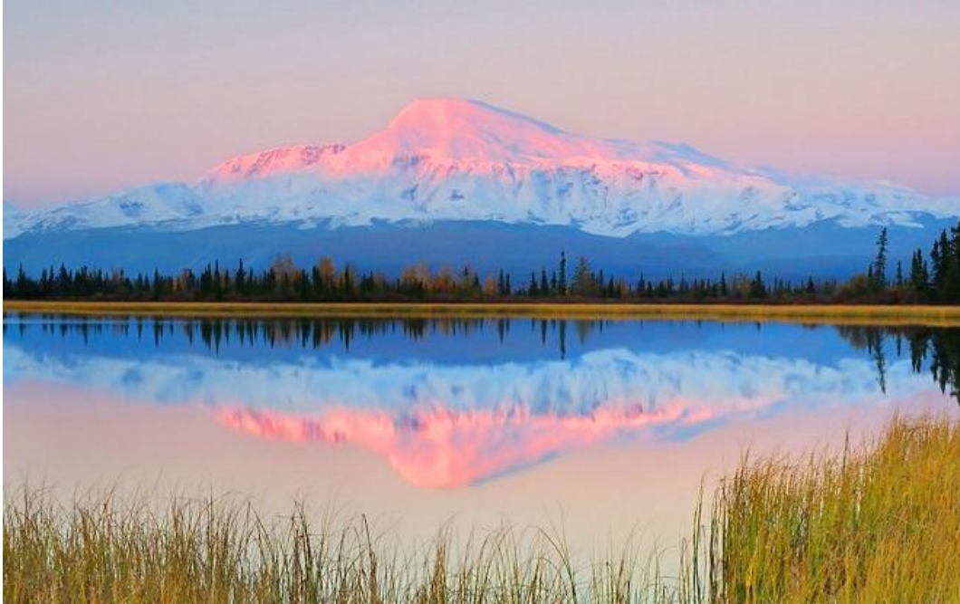
Mt. Sanford sunset (16, 237 ft.)